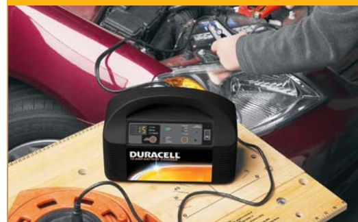
15 Amp Battery Charger