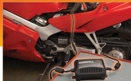
2 Amp Battery Maintainer